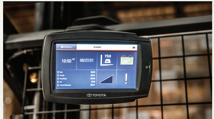
7" Color Touchscreen Display