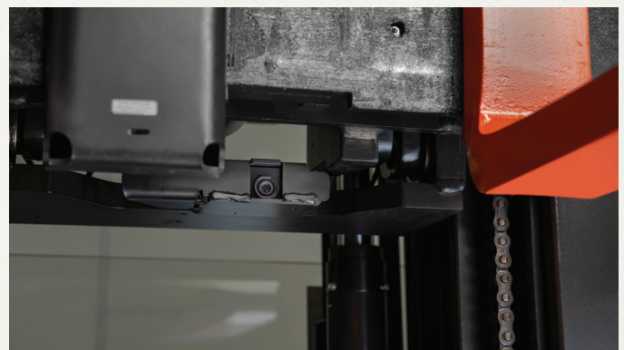
Carriage-mounted camera system