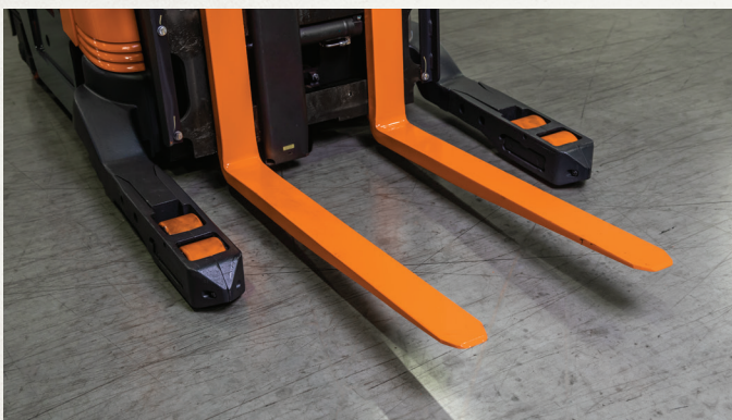
Ductile iron baselegs