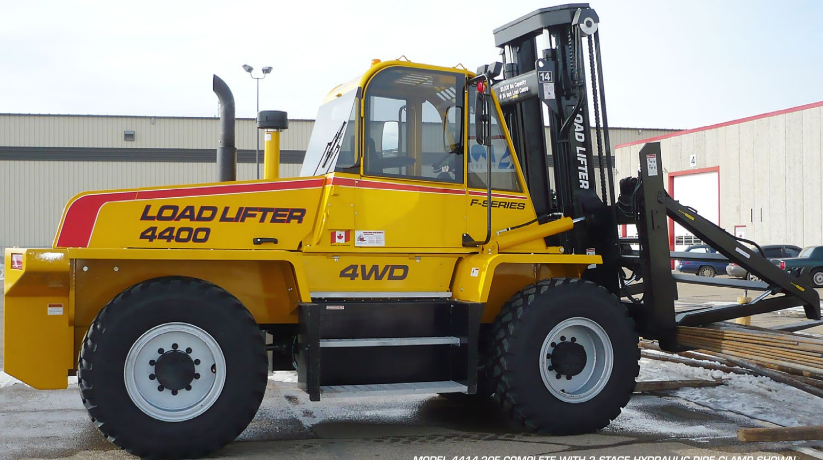
MODEL 4414-20F COMPLETE WITH 2 STAGE HYDRAULIC PIPE CLAMP SHOWN